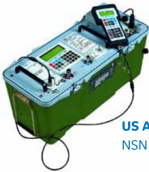
US Army NSN 4920-01-388-6790

Military authorities throughout the world have adopted the ADTS 405F variant as standard equipment such as: