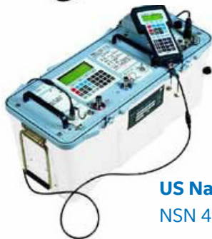
US Navy NSN 4920-01-656-6280