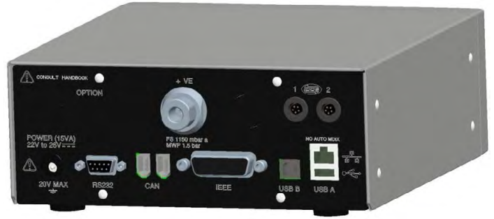
PACE 1001 from the rear