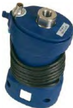
External IDOS universal pressure modul